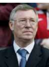
Sir Alex Ferguson